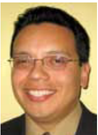
Alfred Melesio City of Joliet

The City of Joliet acknowledged having a major role in leading revitalization. The City proposed focusing on “catalyst projects” to jumpstart implementation. The Joliet City Council has approved an implementation strategy that includes the expenditure of $600,000 over the next 3