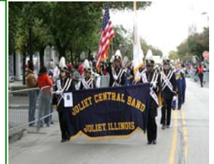
Joliet Central Band